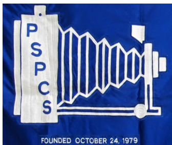
Logo from our Show Banner